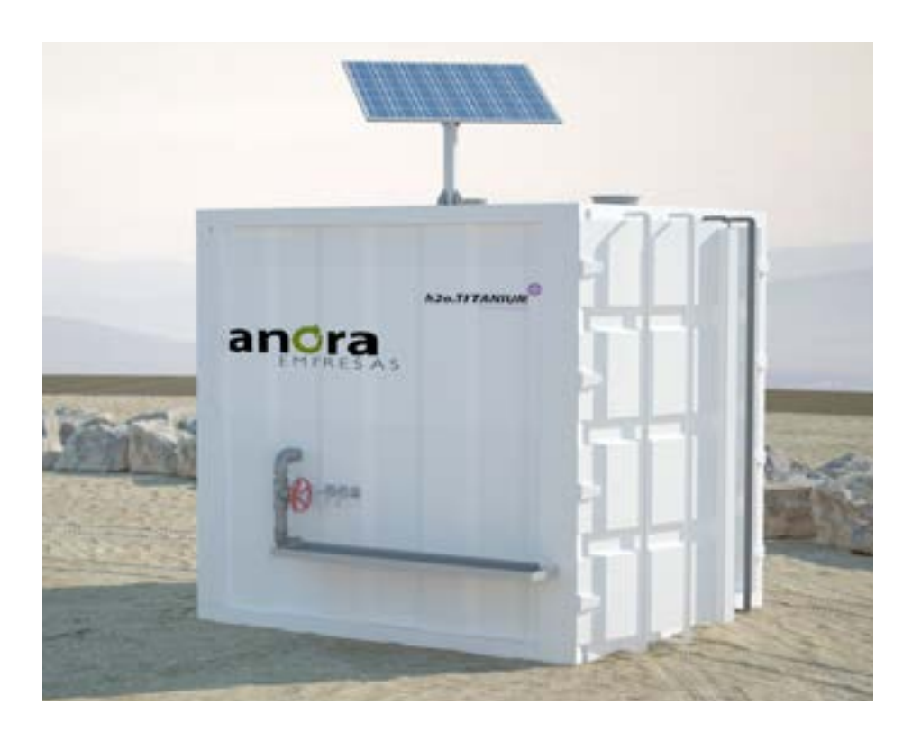
FOUNTAIN CONTAINER FOR ONE TANK. 500 I/h SERVICE.