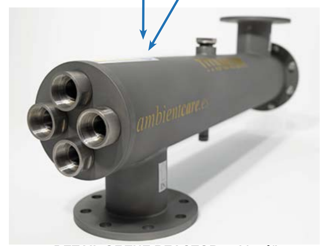
DETAIL OF THE REACTOR. 5-20 m<sup>3</sup>/h.