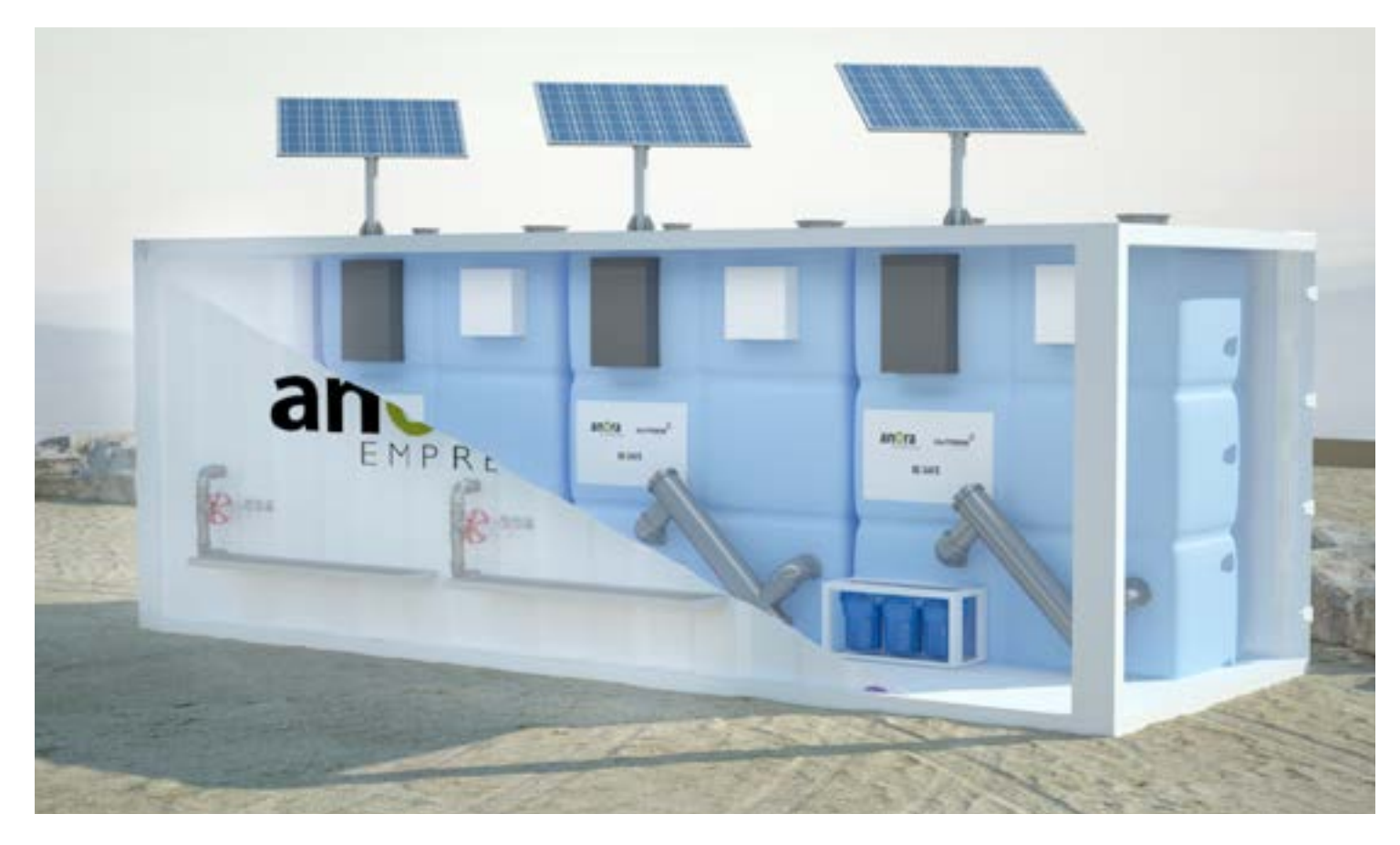
INSIDE VIEW. SECTION 20 m3 CAPACITY. AUTONOMOUS - SOLAR CELLS