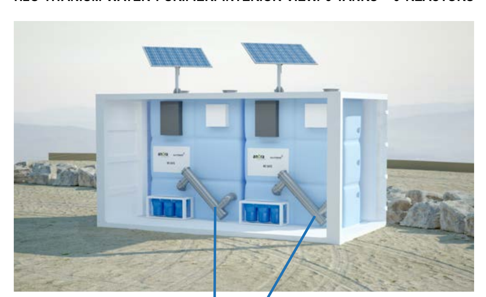
H2O TITANIUM FOUNTAIN 2 TANKS - 4 REACTORS