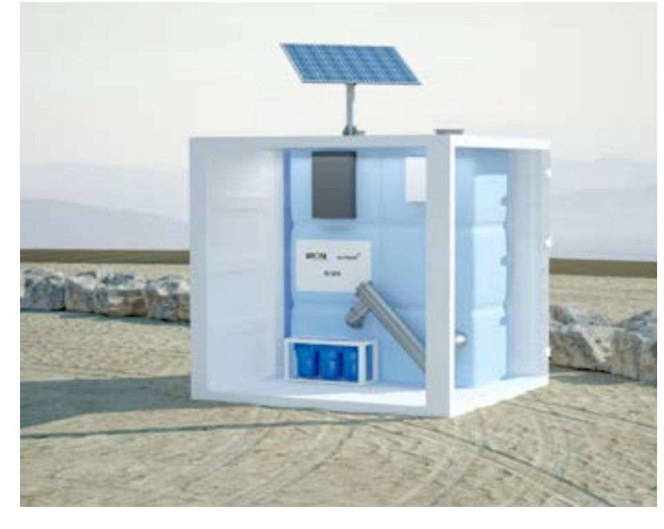
FOUNTAIN CONTAINER FOR ONE TANK. INTERIOR VIEW.