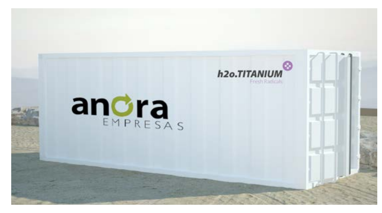
STANDAR 20" CONTAINER