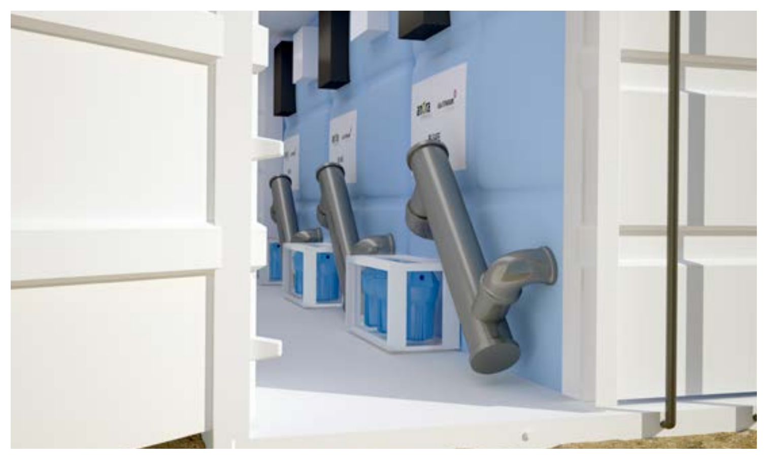
H2O TITANIUM WATER PURIFIER. INTERIOR VIEW. 3 TANKS - 6 REACTORS