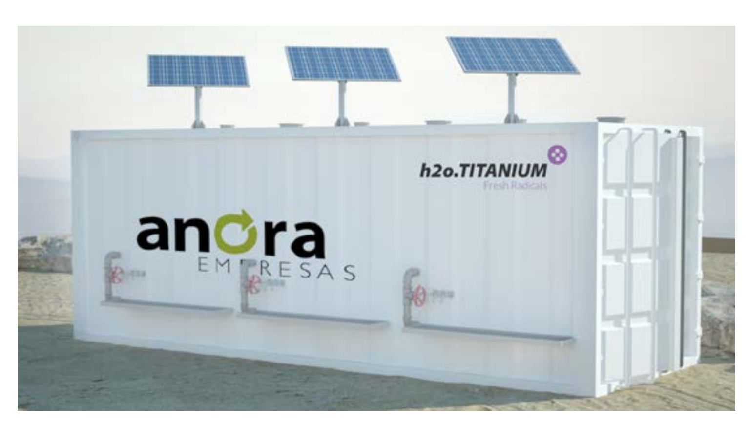
H20 TITANIUM FOUNTAIN 9 TABS SERVICE 1'5 m<sup>3</sup>/h.